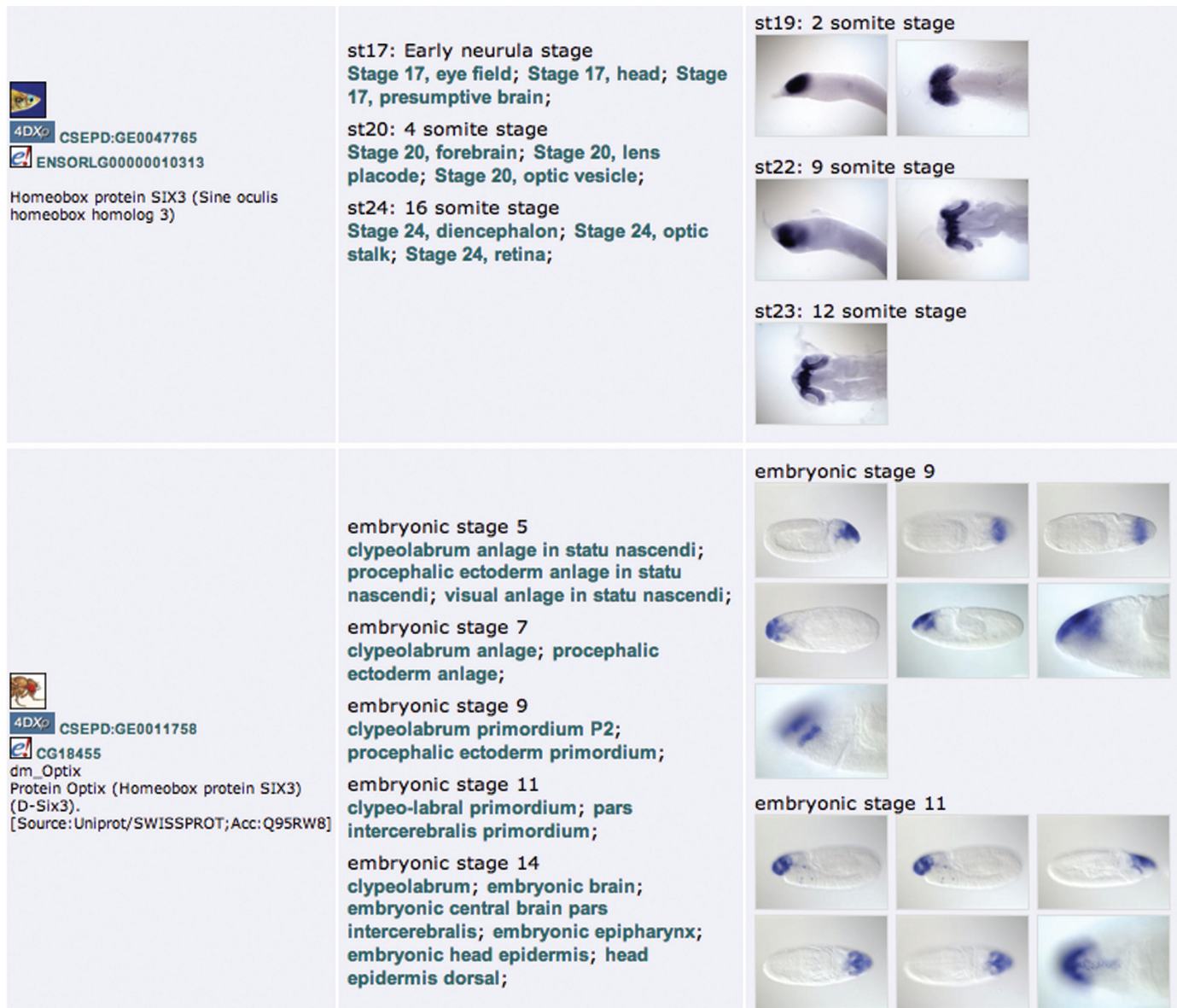
Figure 3. The comparative view shows expression patterns of a list of selected genes (medaka Six3 and its Drosophila orthologue Optix). Expression annotation and images can be easily compared between the genes on a single page.