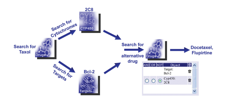
Figure 2. Example of a complex query: search for an alternative drug to Taxol, which adresses the same target Bcl-2, but is not metabolized by the cytochrome 2C8. Procedure: start to search for the targets and the metabolizing cytochromes of Taxol in the associated categories. The resulting lists contain among others the target Bcl-2 as well as the P450 cytochrome 2C8. Second, forward 2C8 and Bcl-2 into the query term box, combine them using the 'NOT' operator and submit the query. The resulting drug list contains two alternative drug candidates for Taxol (Docetaxel and Flupirtine).

Fingerprints allow a fast identification of drugs with very similar physiochemical properties that may interact with the same target molecules. Structural similarity scores and fingerprints are computed with the open-source Chemistry Development Kit (15).